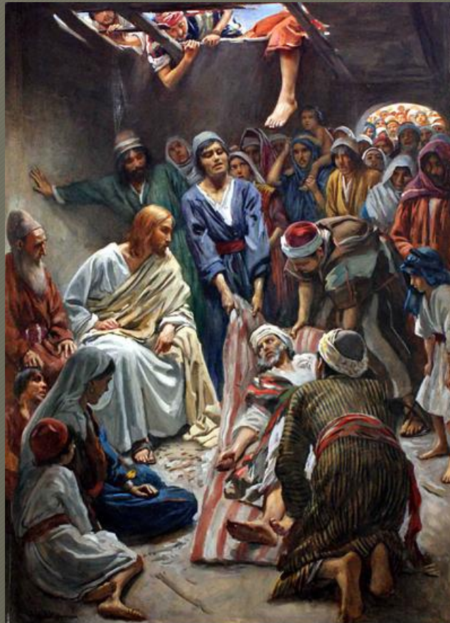
Jesus Heals The Paralytic by Harold Copping

“Son, your sins are forgiven you.” - Mark 2:5